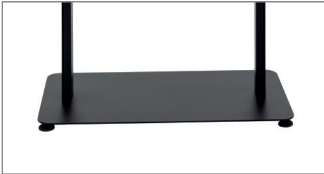
Non-tilting base plate

A version for direct floor mounting is also available. Floormount OM55N-D (Item No.: 1918)